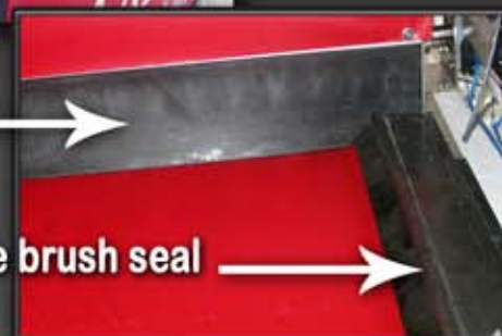
Side brush seal