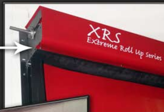
Stainless steel mounting hardware