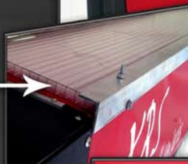
Top rubber seal